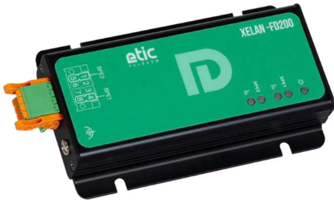
DOC_MPR_XELAN_FD200_Data sheet_A (Latest update 01/14/2025)

You want to extend a LAN network using SPE technology over distances greater than 1km.